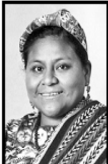
( 1992) Rigoberta Menchú from Guatemala.

" In recognition of her work for social justice and ethno-cultural reconciliation based on respect for the rights of Indigenous people"